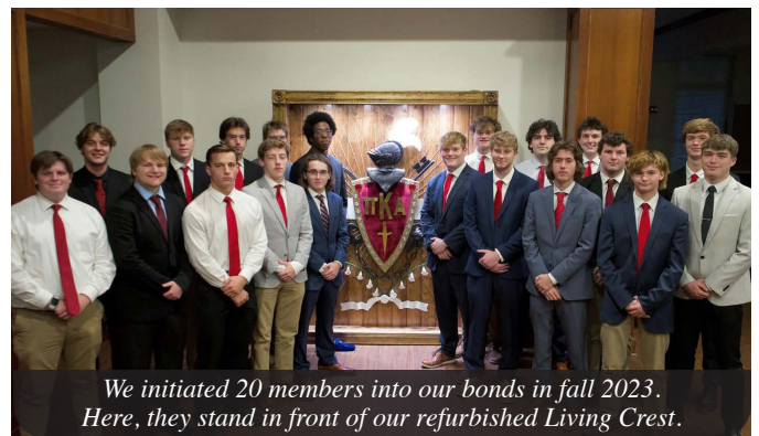
We initiated 20 members into our bonds in fall 2023. Here, they stand in front of our refurbished Living Crest.