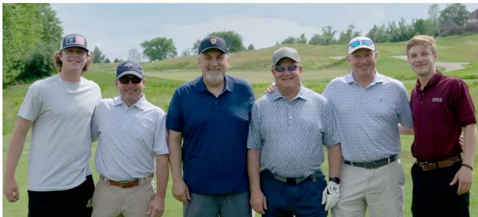
Congrats to our Flight A Championship Teams!