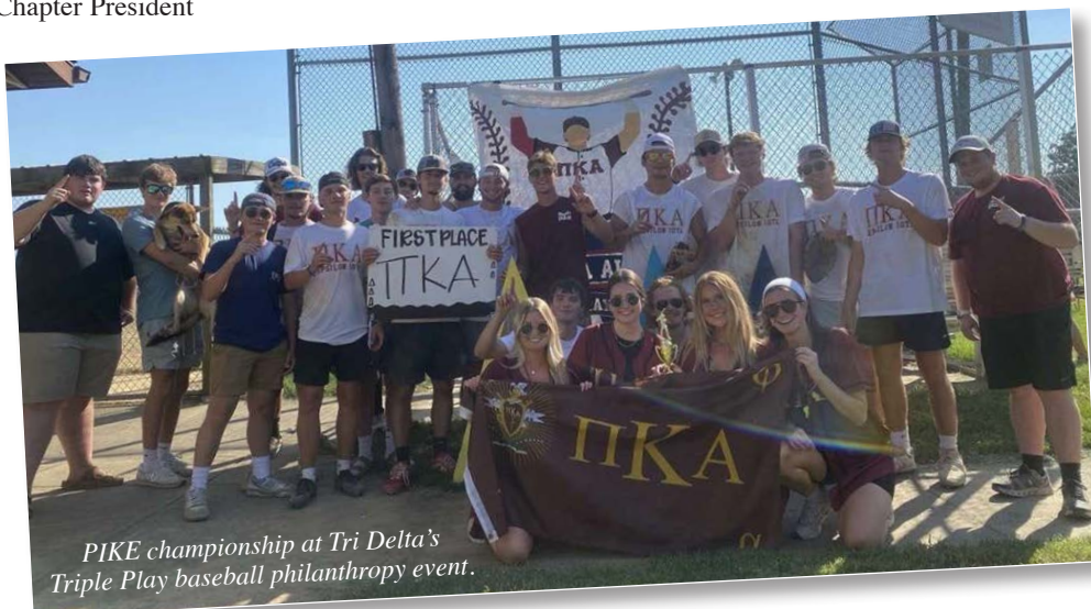
PIKE championship at Tri Delta's Triple Play baseball philanthropy event.