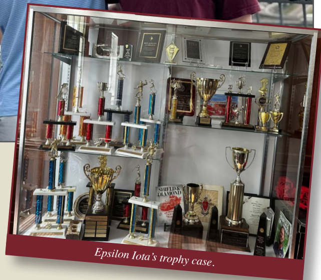
Epsilon Iota's trophy case.